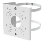
SN-CBK627D Pole Mount